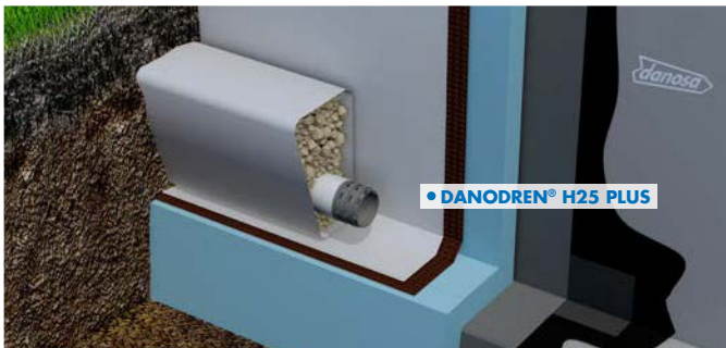
Flexible walls with (SBS) waterproofing.