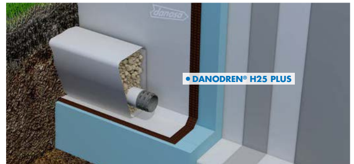
Flexible walls with PVC waterproofing